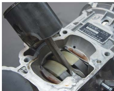
The pistons suffered only minor scuffing.