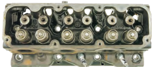
Cylinder head after cleanup with AMSOIL Engine and Transmission Flush. The valve springs and push rod openings are noticeably cleaner, with fewer sludge deposits. The manufacturer's stamping is more easily seen.