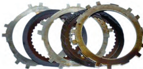
Automatic transmission clutch plates pre-cleanup. Varnish and glazing is heavy on some of the plates.