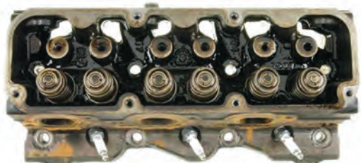
Cylinder head pre-cleanup. Note the sludge deposits on and around the valve springs and push rod openings.