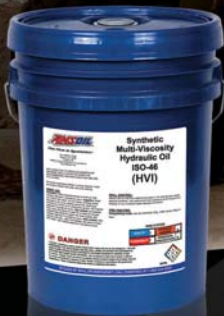
SYNTHETIC HYDRAULIC OIL