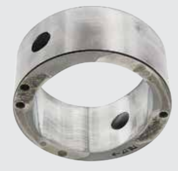
VANE PUMP CAM RING