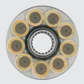
YELLOW METAL PISTON SHOES

After 608 hours of strenuous pump testing in a Parker Hannifin (Denison) T6H20C Hybrid pump, the piston shoes demonstrated only moderate polishing and trace, random scratches, proving AMSOIL Synthetic Multi-Viscosity Hydraulic Oil excels at protecting yellow metals. The vane pump cam ring exhibited only light polishing and trace scratching, further confirming the excellent wear protection provided by the oil.