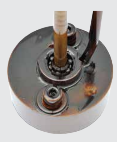
LEADING CONVENTIONAL HYDRAULIC FLUID (ISO 46)