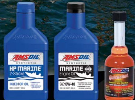
SYNTHETIC 2-STROKE OIL