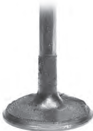
Intake Valve after P.i. Treatment