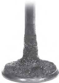
Intake Valve before P.i. Treatment